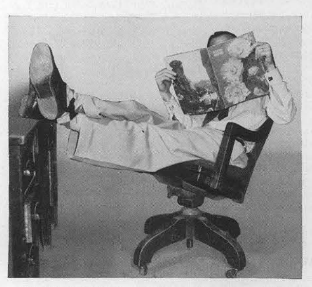
REST PERIOD can be danger time too. Swivel chairs have "booby-trapped" many people and have caused at least one serious injury recently. It's fine to relax, but do it safely.